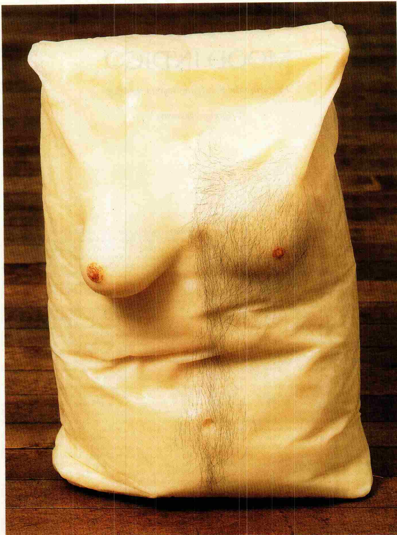
Robert Gober, Untitled , 1990