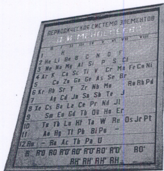
Figure 5. Photograph by Valentin Ostrovsky of the memorial in St. Petersburg titled "Periodic System of Elements of D. I. Mendeleev" based on his periodic table of 1905. The groups are subdivided in vertical families, although not specifically labeled, nor are atomic numbers or atomic weights indicated (this is an artwork rather than a scientific document).

In the 1969 book by Nekrasov (5) we have his modernized version of the tables of 1905 and 1934 labeled "System of Mendeleev". This 1969 version (see Figure 6) is interesting