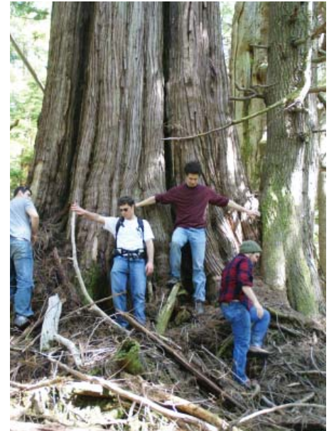
Students from the 2009 Forest Ecology class

Forests influence every natural resource issue on our landscape. A basic understanding of site specificity, forest development, and habitat development is essential to be an effective participant