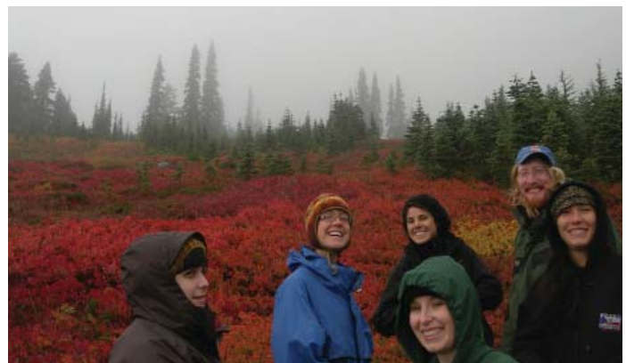
Students from the Fall 2010 Sustainable Forestry class