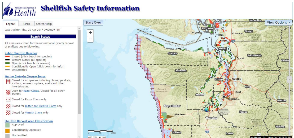
Figure 3: Shellfish Safety Map

The Washington Department of Health has been pushing for more people to utilize their online shellfish safety map (Figure 3) as a source of closure information. To spread more awareness of this useful tool I passed out outreach material developed by the WDOH during interviews. Out of the 29 people interviewed none responded with being familiar with the Shellfish Safety Map. This tool is only available online, but can provide specific beach location information regarding causes of closures. This is an identified area for the Department of Health to consider in their public outreach attempts.