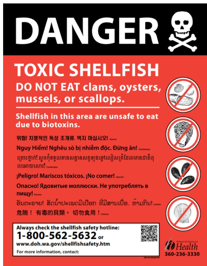
Figure 1. The Washington Department of Health Beach Closure Sign

The skull and crossbones symbol is a clear indication of a risk, warning, or danger to human wellbeing and health. In Washington State, one risk to human health is the consumption of shellfish. Molluscan bivalve shellfish, or shellfish with a two-hinged shell such as mussels, clams, scallop, geoduck, and oysters, are filter-feeders. In the process of filter-feeding large amounts of water, small bacteria, naturally occurring organisms, viruses, and other contaminants present can be absorbed into the tissue of the shellfish (Rodríguez-Lázaro et al., 2012). If contaminant levels are high enough, the harvested shellfish can make individuals who consume them ill.