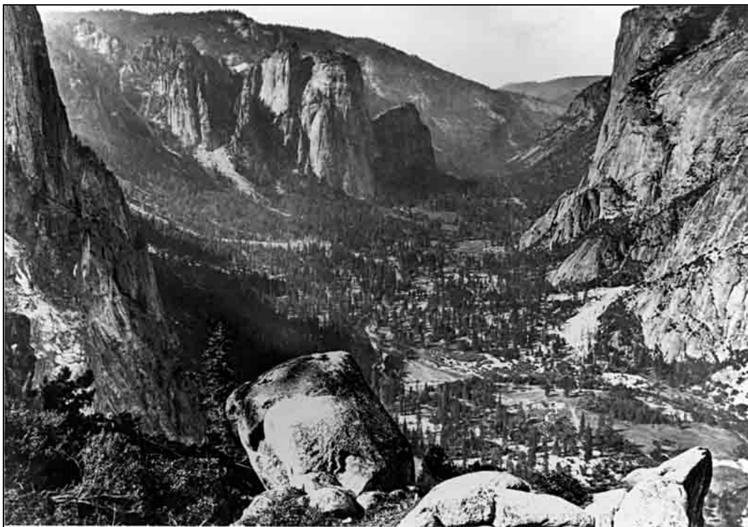
Figure 2: View of lower Yosemite Valley from Union Point on the Four Mile Trail, 1866, two years after Yosemite became protected.

Finally, in 1864 under Abraham Lincoln's presidency, Congress gave the Yosemite Valley to the State of California (Figure 2) for "public use, resort, and recreation" (Miles, 1995). Although this significant moment went fairly unnoticed at the time, as America was broken apart by the Civil War, the idea of national parks had taken hold. The protection of Yosemite Valley in 1864 served as platform for land conservation, which in return provided a model for the birth of the National Park System (Lower, 2018).