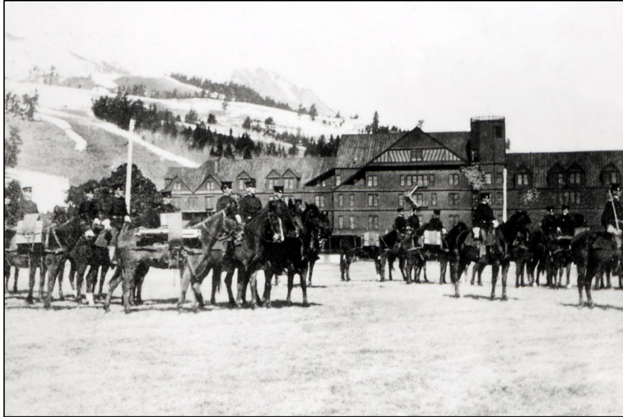
Figure 4: Machine gun platoon at Fort Yellowstone, date unknown.

While they did not receive training in parkland management, they did their duty, taking a militaristic approach to preserving and protecting Yellowstone from environmentally harmful practices, and left the park in a physically maintained state. Although there was success in protecting early parks, the military structure enabled a white, male-dominated and hierarchical culture of masculinity, aimed to dominate nature. Some of the aggressive tactics the military used under a lingering eye of Congress proved hard to diminish once their control was transitioned to a new organization, the National Park Service.