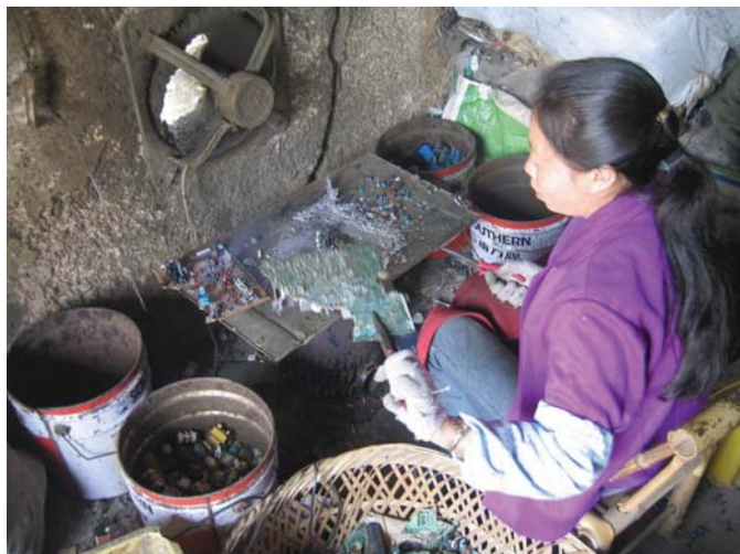
Figure 3. Circuit board baking.

Table 2 presents BLLs for 165 exposed children in the four villages. The findings showed that BLLs from different villages were in the following descending order: Beilin, 19.34 \mu\text{g/dL} > Dutou, 17.86 \mu\text{g/dL} > Huamei, 14.23 \mu\text{g/dL} > Longgang, 13.13 \mu\text{g/dL} (Table 2). Children living in Beilin, where the number of e-waste workshops specializing in equipment dismantling, circuit board baking, and acid baths, had the highest BLLs. Dutou,