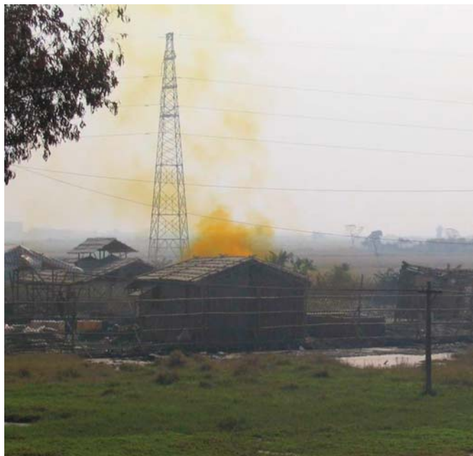
Figure 5. Yellow smoke from acid bath hut.