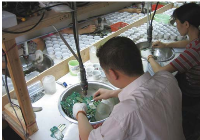
Figure 4. Circuit boards of cell phone being dismantled.