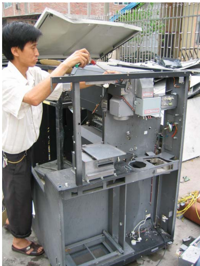
Figure 2. Equipment dismantled with simple tools.