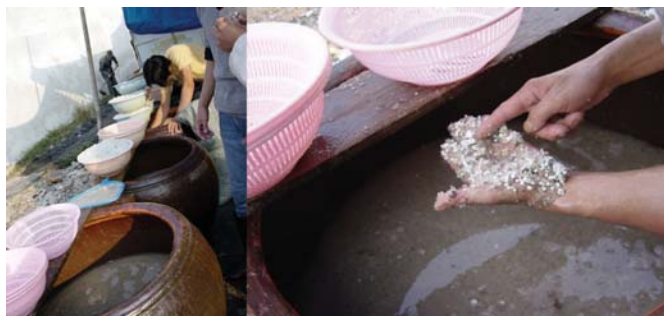
Figure 6. Plastic reprocessing by gravitational separation into ceramic jugs with brine.